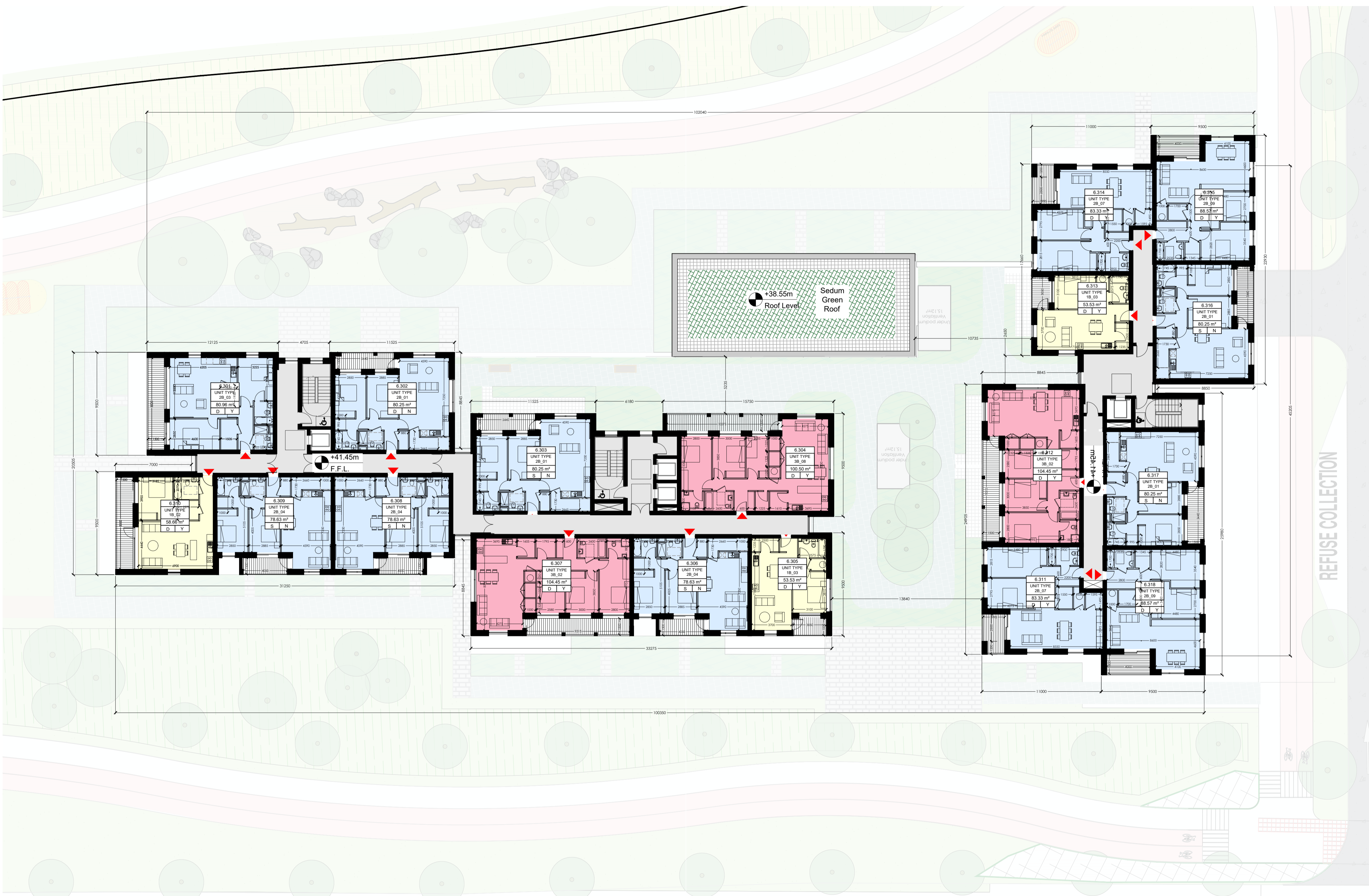
3rd Floor Plan - Block 6 Scale 1:200 @A1